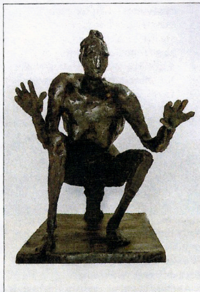
Germaine Richier, La Sauterelle, Grande , 1955–56, dark patinated bronze, 54" x 39" x 69". Dominique Lévy.

Treating sculpture not so much as weighty, impenetrable form but rather as something attenuated, fluid, and pierced by space (blithely disregarding